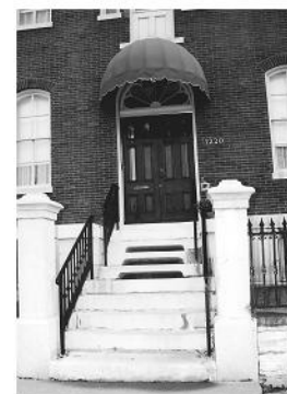
Church and Rectory steps to be replaced

After having replaced the front steps last year, similar restoration will move around to the 11th Street side-entrances to both the church and the rectory for stone steps replacement. As in the front of the church, with the deterioration of the steps in these two areas, they are also presenting a safety concern. The eleven six-foot sidesteps will be removed and replaced; the top landing at the church side-doors will be restored by cutting out badly weathered areas and epoxying them in stone to match the existing area. The rectory stair restoration will involve removing and replacing eight six-foot wide steps, repairing the stone caps, the walls and plumbing up the two stone columns.