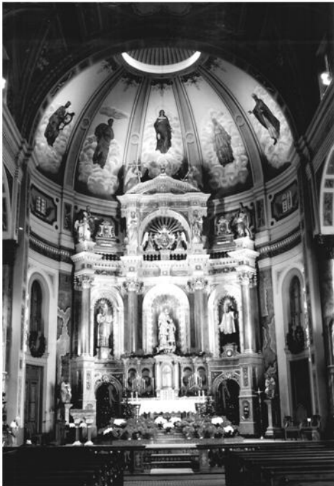
Historic Altar of Answered Prayers with new lighting

It took a long time to happen, but with the door restoration and the new steps in place this past year, the exterior central façade area between the towers from the top of the Shrine all the way down is now completed, thanks to your wonderful support. Of course, much still remains to be done. But, having finished this entire area gives us faith that, in due time, the remaining exterior restoration is achievable. Thus, it was a busy 2004 with the completion of these projects: