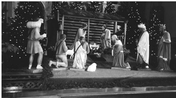
Shrine Nativity Scene

While the Shrine is a special place to go to Mass anytime, it would be difficult to find anyone in attendance on Christmas Eve who would not have felt that the Shrine was an especially holy and blessed place of worship that night. Despite a windy, frigid night, nonetheless, about 350 people were in attendance.