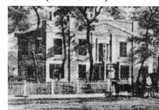
The Biddle Mansion