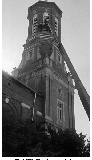
Ted Wofford examining West Tower from lift.

A number of conditions will require replacement with new or cast stone material in the same way that window surrounds and sills were treated in the lower work. This kind of replacement requires enough bearing to support it. The projecting cornices that relate to