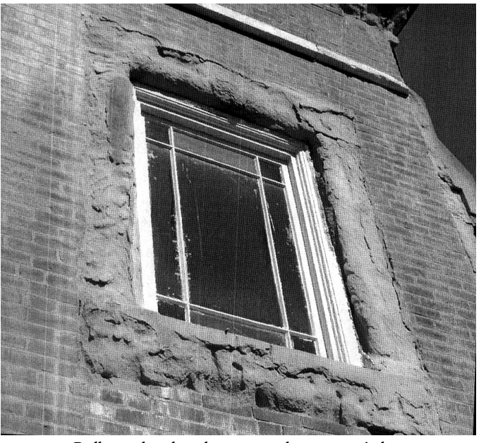
Badly weathered sandstone around an upper window.

It had been our hope, due to the distance from viewers that limits close visual inspection, to simply re-build many of the profiles once we had taken off the unsound material; however, our inspection has substantially reduced the scope of this simplest form of restoration. Many of the surfaces that appeared sound, even through binoculars, have been found to be eroded behind the facing that hangs with very little physical connection, and are not