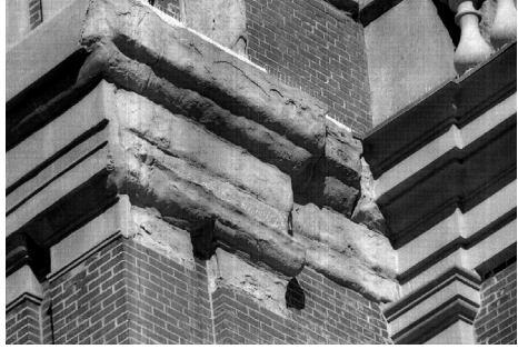
new element of the work, A striking difference: Unrestored dissolved stone surfaces between completed restored areas.

The addition flashings on the horizontal surfaces is the major and, if properly designed,