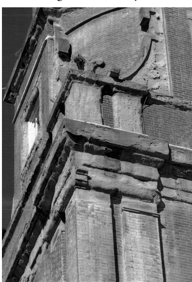
Typical deterioration of stone on corners and horizontal surfaces.

In November, the presence of the painters re-painting the tower louvers of the two belfries offered the opportunity to use their lift to inspect the condition of the stone on the towers prior to preparation of the necessary construction documents required to contract for this last major phase of the restoration work. This inspection was documented in over 175 digital photos permitting enlarged examination of selected trouble spots. This close-up physical investigation indicated that the condition of the stone varies over an extreme range, from relatively sound to almost totally eroded.