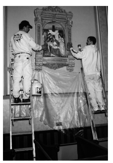
Stations of the Cross getting a refurbishing.

Other projects completed were: repair and replacement of deteriorated areas of the louvers and rosettes on the towers, $23,495; sealing and striping the parking lot, $1,968; pigeon-proofing cornices around the church roof, $5,361; sanding and re-staining the rectory floor to a beautiful appearance, $350. A major project for this fall is a new drainage system to properly disperse water on the west side so as not to damage the stone wall.