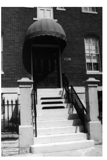
A new rectory entrance.