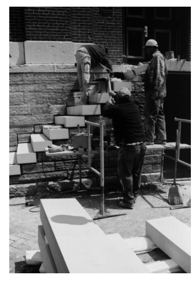
The new steps each weighing over 700 lbs. being set in place.