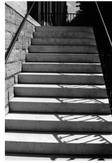
Completed new steps at church side entrance.